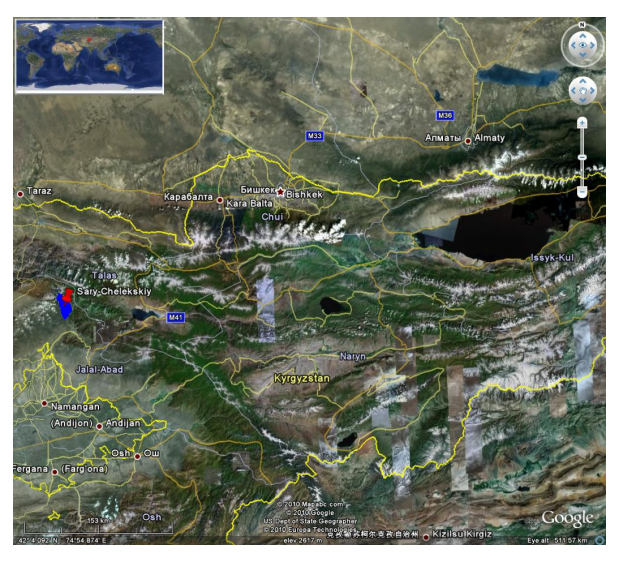
Figure 1. Google Earth image with study area marked in blue (red pin).